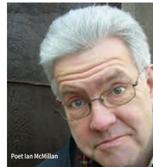
Poet Ian McMillan

10am–12pm and 1pm–3pm Suitable for ages 8–12, £2 per child | Booking essential at Art Tickets www.artfund.org/whats-on/museums-and-galleries/experience-barnsley