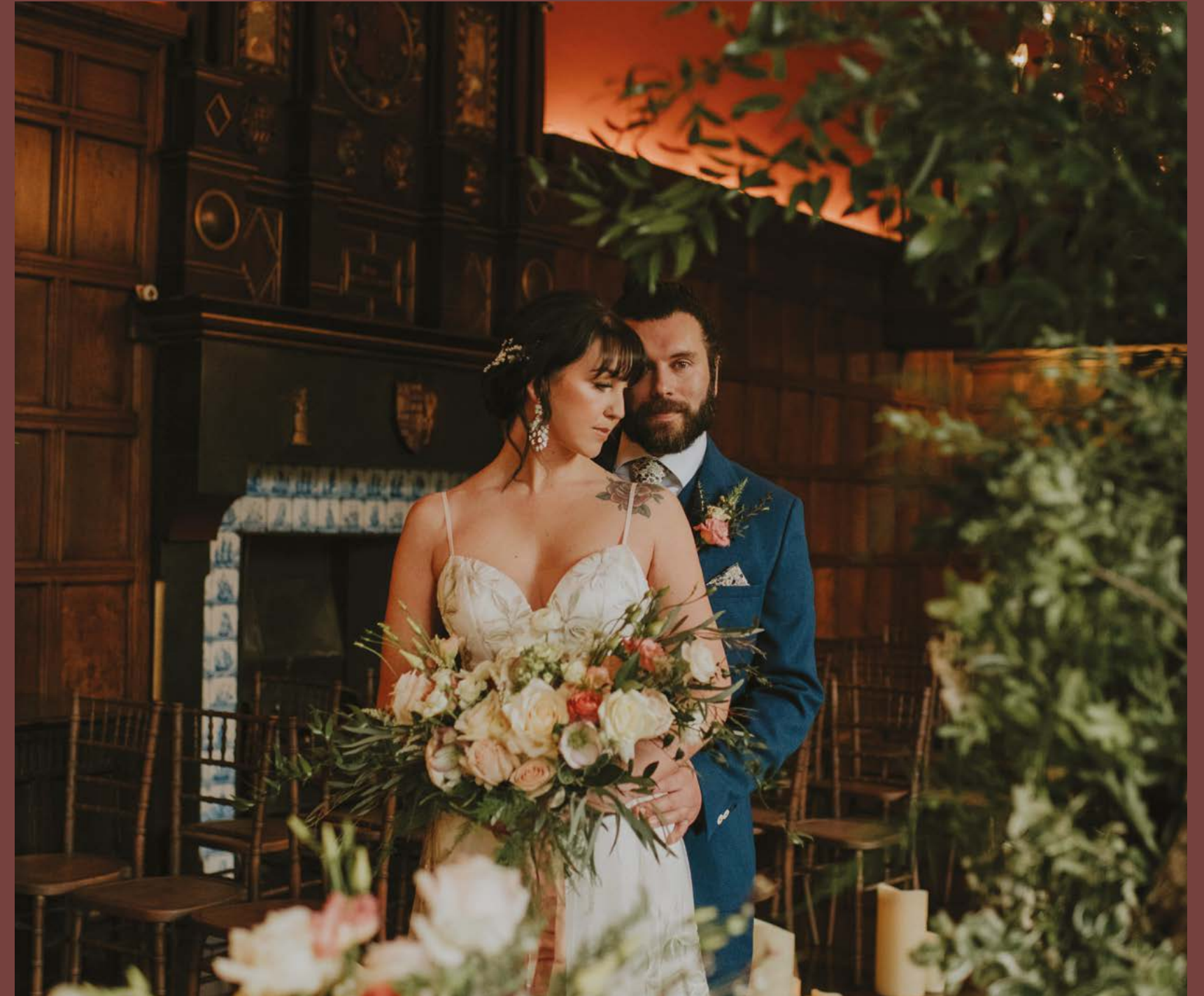
FEATURES A GRAND FLORENTINE FIREPLACE